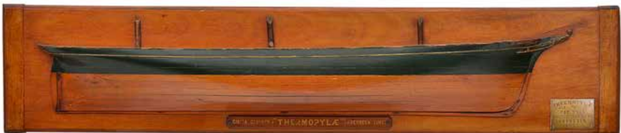
Shipbuilder's model of Thermopylae built in 1868 by Walter Hood & Co, Aberdeen, acquired by Aberdeen Art Gallery and Museums.

nationalfundforacquisitions.wordpress.com/2015/08/18/thermopylae-an-idea-of-perfection/