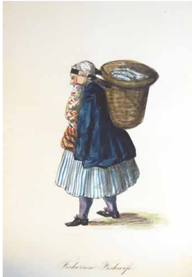
Pen and ink and watercolour, Fisherrow Fishwife , by James and George Howie, acquired by Edinburgh City Archives.

Edinburgh City Archives acquired a collection of 93 illustrations of Edinburgh tradespeople, possibly the work of James Howie (c1846–1910) and his brother George Howie (c1854–1890). Executed in pen and ink and watercolour, they depict a wide range of trades that would have been familiar to Edinburgh's residents during the second half of the 19th century. The City of Edinburgh Council collection already contains 311 illustrations from the same series and the acquisition of this further set adds considerably to the variety and diversity of the collection. The images evoke the ordinary individuals, rarely recorded, who conducted their trades in the streets of Edinburgh, from the vegetable seller, the fishwife and the china mender to the rat catcher, the street preacher and the carrier of children's coffins. Each character has individual features suggesting that they were drawn from life. The Howies' purpose in creating the series is not clear but their legacy is a fascinating and invaluable record of everyday life in Victorian Edinburgh.