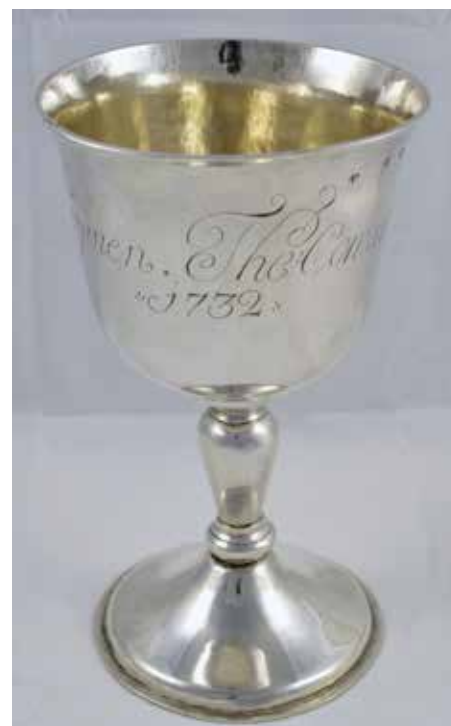
One of a pair of silver communion cups for the Kirk of Drymen, c1732, by Johan Gottleiff Bilsinds, acquired by the Stirling Smith Art Gallery and Museum.

Inverness Museum and Art Gallery acquired a striking glass of the Inverness Hammermen Incorporation dating from the mid eighteenth century. In 1676 tradesmen in Inverness were granted the right to organise themselves into six craft guilds. The hammermen included blacksmiths, gold and silversmiths, saddlers, tin and coppersmiths, armourers, cutlers, pewterers and clock and watchmakers. Such glasses, typically characterised by thick feet and short stems, were designed for convivial toasting, a feature of these exclusively masculine trade associations. Their contents were consumed in a single toast and the glasses slammed down on the dinner table, a clue to their current rarity. The resulting sound, similar to a volley of musket fire, gave rise to the alternative name 'firing' glass.