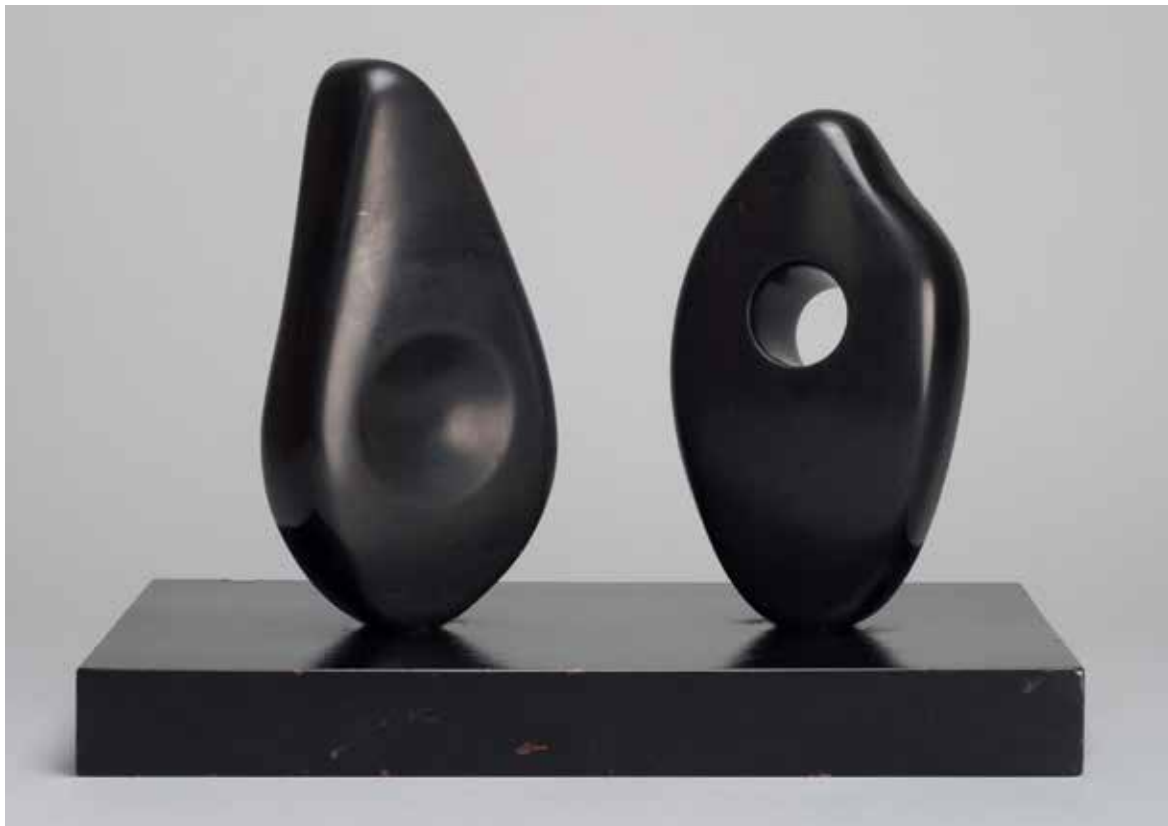
Cover: Carved slate sculpture, Two Forms (Orkney), 1967, by Barbara Hepworth, acquired by the Pier Arts Centre.