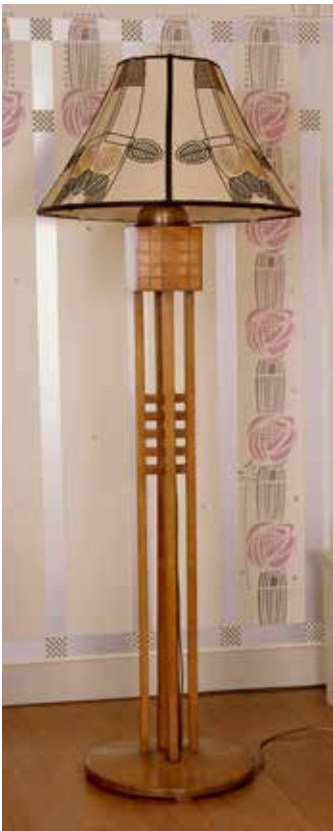
Standard lamp, 1905, designed by Charles Rennie Mackintosh for The Hill House, Helensburgh, acquired by the National Trust for Scotland.

Three organisations received grants to acquire examples of Scottish furniture. The National Trust for Scotland received a grant of £20,000 towards the acquisition of an armchair and standard lamp designed by Charles Rennie Mackintosh and made by Alex Martin in 1905 for The Hill House, Helensburgh. Commissioned in 1902 by the publisher Walter Blackie, The Hill House is the only surviving domestic building by Mackintosh which is still substantially furnished with its original contents. It is regarded as one of the finest buildings in Mackintosh's oeuvre and his most significant domestic commission. The building, interior and most of the furnishings were designed by Mackintosh as one whole, down to the smallest detail. The acquisition of this chair and lamp, designed for the drawing room, enables the National Trust for Scotland to maintain the completeness of this important building.