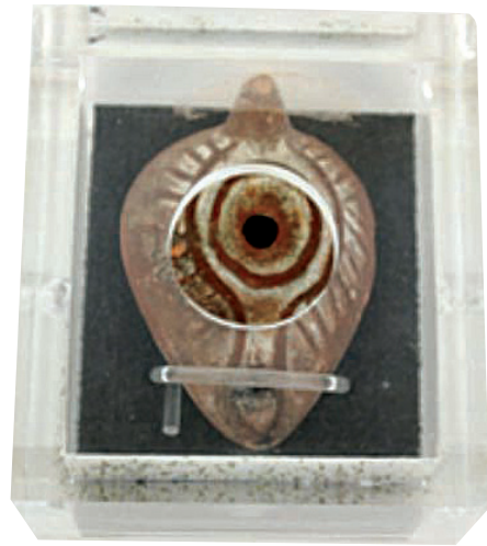
Original oil lamp