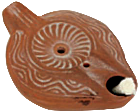
Replica oil lamp