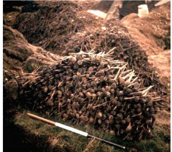
Image of the original Inchtuthil hoard