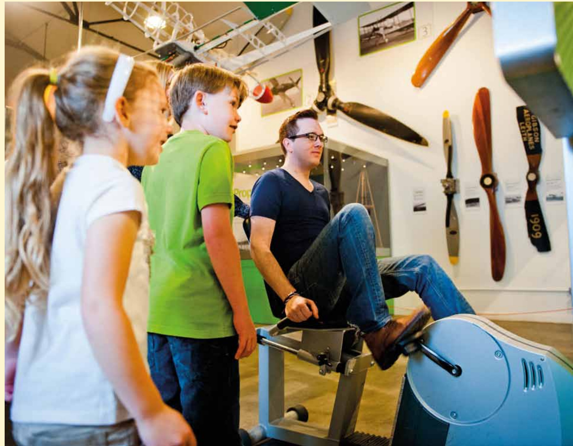
The Fantastic Flight display, National Museum of Flight

And to all those who prefer to remain anonymous.