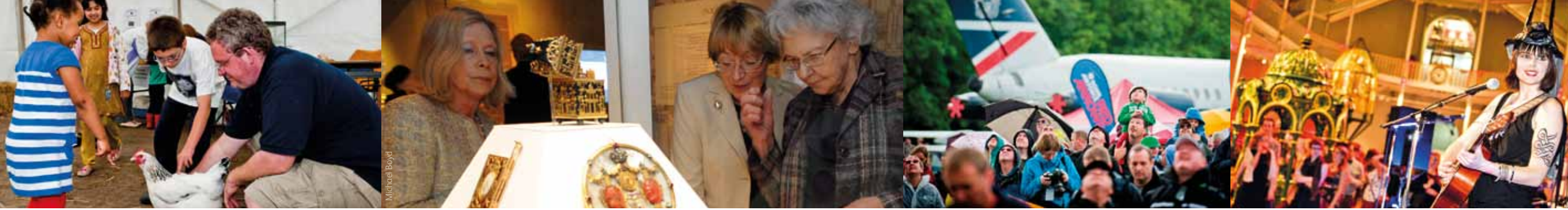
1. The Country Fair at the National Museum of Rural Life 2. The Catherine the Great exhibition staged with the State Hermitage Museum, St Petersburg 3. 11,000 people attended the Airshow at the National Museum of Flight 4. Our after-hours events, the RBS Museum Lates, have been a sell-out