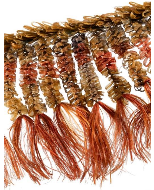
Detail of skirt made with dyed hibiscus bast, Samoa, National Museums Scotland (A.1897.188.3)