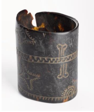
Arm ornament of turtle shell, Admiralty Islands, 19th century, National Museums Scotland (A.1898.439)

Turtles have significance in many parts of the Pacific. Historically, turtle meat was reserved for high ranking individuals and turtle shell was, and some places still is, a valuable material associated with wealth and status. It is recognisable by its mottled brown colour and hard shiny appearance. Turtle shell can be manipulated into shapes by first softening it using heat to make it more malleable. It is not uncommon to see this material incised with patterns.