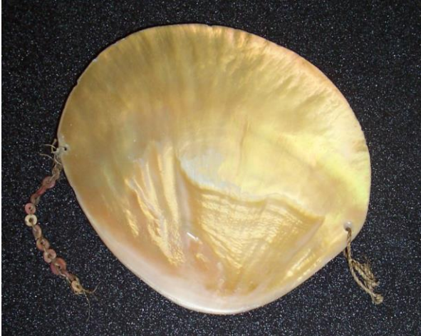
Gold lip shell with attachment of spondylus shell discs (pink coloured shell commonly seen on Melanesian artefacts), Papua New Guinea, 19 th century, National Museums Scotland (A.1882.91.77)