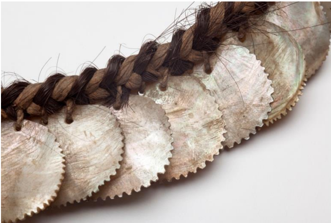
Detail of pearl shell neck ornament on cord of braided coconut fibre and human hair, Kiribati, Perth Museum & Art Gallery (1977.1712)

Pearl shell is used for decorative inlay as well as in dress and adornment. For the latter they can be cut or used whole as in breast ornaments. White lip oyster shell is used for elaborate inlay in the western Solomon Islands, in canoe models and bowls from Manihiki in the Cook Islands, and in artefacts from Palau in Micronesia. Gold lip oyster shell has a soft gold colour and is often seen worked into a crescent shape in Papua New Guinea and West Papua where it is used as a shell valuable in local exchange systems. This is called kina in Papua New Guinea, which has been the name for modern currency in the country since 1975. Gold lip shell is also used for breast ornaments in the Torres Strait Islands and the Solomon Islands. Black lip oyster shell has a dark edge and is more commonly found in artefacts from the Society Islands and surrounding areas.