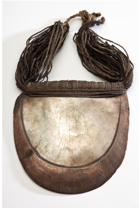
Black lip shell breast ornament, Society Islands, 18 th or early 19 th century, Perth Museum & art Gallery (1977.1417)