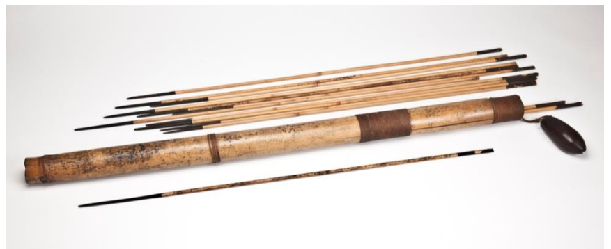
Quiver and arrows with stopper of an immature coconut, Tahiti, Society Islands, 18 th or early 19 th century, Perth Museum & Art Gallery (1978.173)