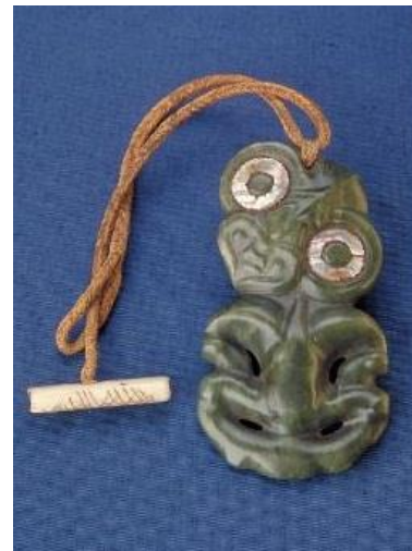
Hei tiki pendant of greenstone with eyes inlaid with haliotis shell (abalone; paua ), New Zealand, 19 th century, University of Aberdeen Museums (ABDUA: 4034)