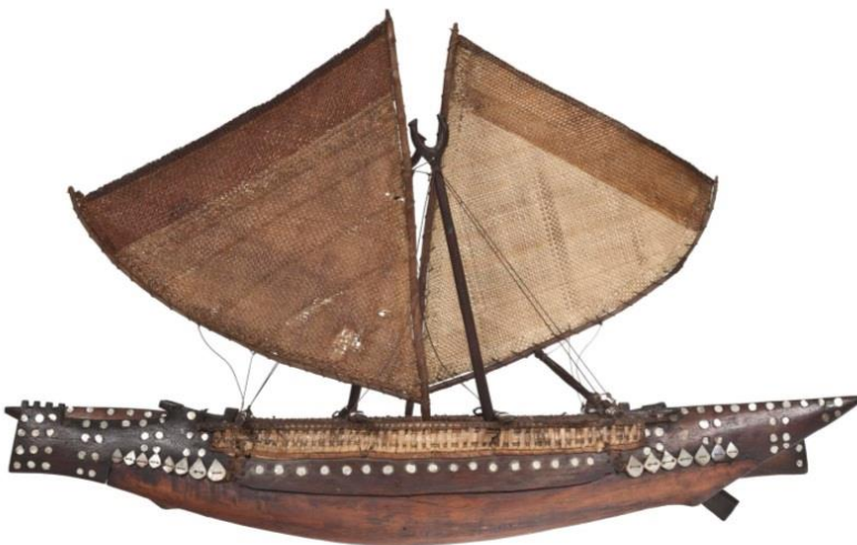
Canoe model with pearl shell inlay, Manihiki, Cook Islands, National Museums Scotland (A.1902.73)