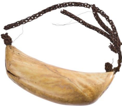
Ceremonial sperm whale tooth ( tabua ), Fiji, National Museums Scotland (A.1896.58)

Sperm whale teeth are used as a raw material, mainly in body adornments, in a number of places in the Pacific. The material is often referred to as whale ivory due to its appearance and certain objects may have been smoked and rubbed with coconut oil to give them a rich reddish-brown patina.