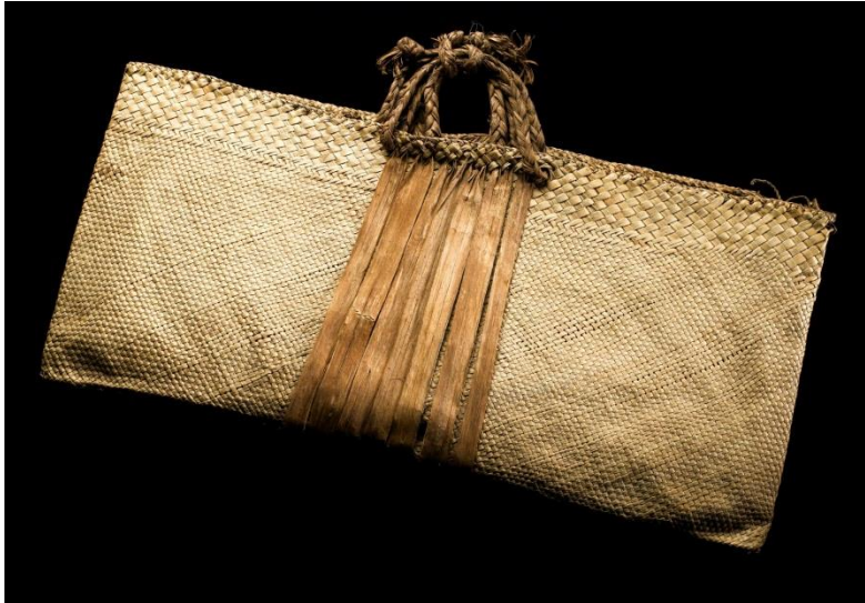
Basket of woven pandanus leaf, Efate, Vanuatu, National Museums Scotland (A.1889.550)

Different varieties of pandanus, also termed screw pine, grow across the Pacific. The plant is palm-like but not closely related. Pandanus leaves are commonly used in making baskets, skirts, mats and fans as well as being used for housing and medicine. The wide leaves will often be split for use in fine weaving.