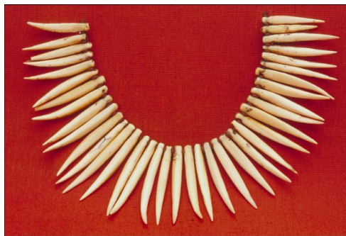
Neck ornament of split whale teeth, Fiji, University of Aberdeen Museums (ABDUA: 4583)