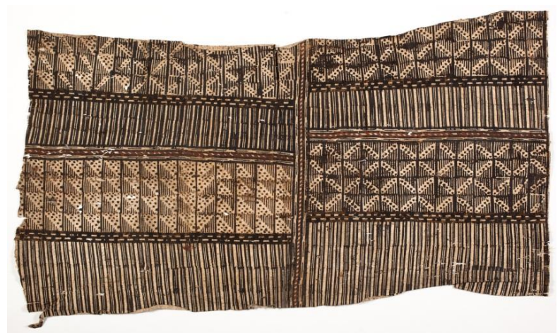
Barkcloth ( masi ), Fiji, late 19 th century, Perth Museum & Art Gallery, (1978.2376)