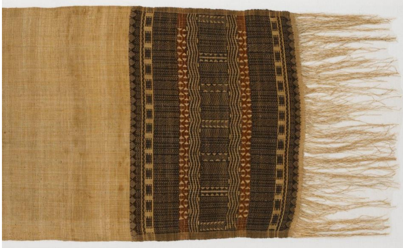
Detail of mat woven from banana fibre, Caroline Islands, National Museums Scotland (A.1899.320)

Shredded banana fibre has a distinctive golden sheen. Shredded banana fibre is used in making skirts although they are not as prevalent in museum collections as those made of hibiscus. Banana fibres are woven on a loom both in the Santa Cruz Islands to make bags and mats and across the Caroline Islands chain in Micronesia to make fine textiles.