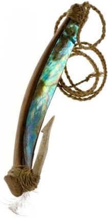
Fish hook with haliotis (abalone; paua ) shell, New Zealand, collected mid-19 th century, National Museums Scotland , (V.2007.300)

Also termed abalone, the inside of this shell has a distinct blue-tinged iridescent appearance. It is used in a number of Māori artefacts as inlay for eyes in wood carving, hei tiki figures, and other examples of taonga (Māori treasures). Haliotis is also used in composite Māori fish hooks, particularly as lining for a curved piece of wood which forms the body of the hook. The reflective nature of the shell means it acts as an effective lure. The Māori term for this haliotis shell is paua .