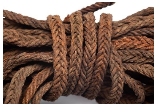
Detail of braided coconut fibre twine, Fiji, Perth Museum & Art Gallery (1977.1376)