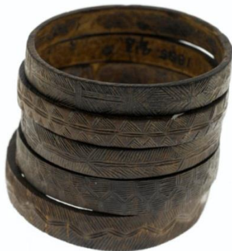
Carved coconut shell arm ornaments, south Vanuatu, 19th century, National Museums Scotland (A.1895.413.42)

The shell of a coconut is sometimes seen split into sections to make arm ornaments (as in Vanuatu) and cut into shapes to decorate larger items (such as on a Tahitian mourner's costume). Young or immature coconuts are much smaller and are used in a variety of ways such as for carved figures in the Gulf of Papua New Guinea and for practical purposes as a stopper on the end of a quiver from Tahiti.