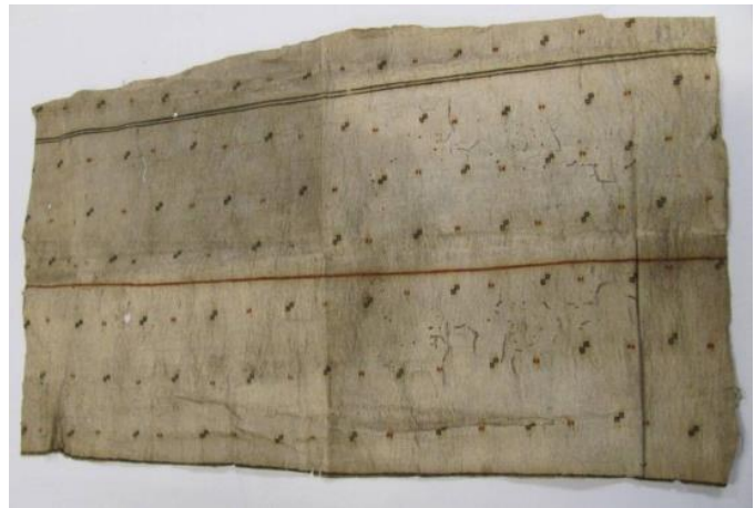
Barkcloth ( kapa ) from the Hawaiian Islands, National Museums Scotland (A.UC.391)