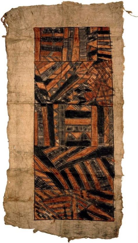
Barkcloth from Tahiti, Society Islands, 18 th century, National Museums Scotland (A.UC.442)

Barkcloth is a soft felt-like material made from the beaten bark of a tree, usually paper mulberry. At one time it was made across the Pacific however the increased availability of cotton cloth impacted on production in the 19 th century. The term tapa is often used interchangeably with the word barkcloth but there are many local names specific to different cultural areas. Barkcloth continues to be made in some areas today and is used in work by contemporary Pacific artists and fashion designers.