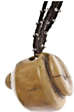
Carved whale tooth pendant on cord with attached glass trade beads - beads originated outside of the Pacific and were a valuable obtained through exchange, Fiji, National Museums Scotland (A.1924.779)