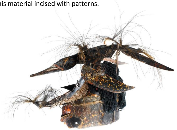
Dance mask of turtle shell with cassowary feathers and hair, Saibai, Torres Strait Islands, 19th century, National Museums Scotland (A.1885.83)