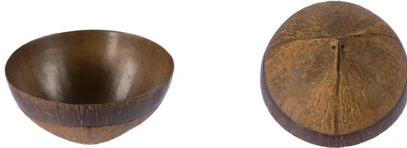
Coconut shell cup, Fiji, National Museums Scotland (A.1900.481)

Coconut shell has a distinctive in appearance. It is rich brown in colour flecked with lighter brown and is often worked to have a smooth finish. Shells can be split in two to make cups for domestic use as well as more formal occasions such as kava drinking ceremonies. Cups may be plain or carved depending on the provenance and use, but the material is still recognisable.