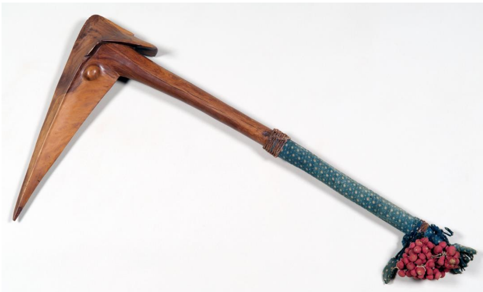
Bird head club of wood with handle wrapped in trade cloth, New Caledonia, 19 th century, Glasgow Museums (1870.21.a)