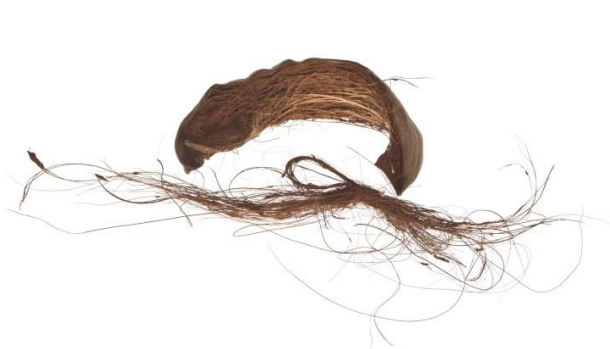
Section of coconut husk from Kiribati, National Museums Scotland (A.1917.51)

Fibres from different parts of the coconut are used as a raw material. It is not uncommon to see the term 'coir' used in museum documentation to describe coconut fibre. Specifically, coir is the raw material found between the hard internal shell and the outer coat of a coconut.