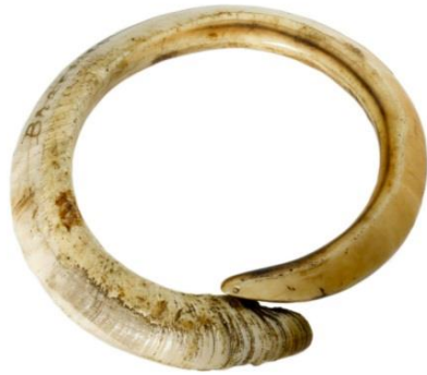
Arm ornament of boar tusk, Hawaiian Islands, National Museums Scotland (A.1956.1020)

The tusks of pigs continue to be valued in the Pacific today and are particularly associated with Papua New Guinea, Vanuatu, Solomon Islands and Fiji. Pigs have significance in ritual and ceremonial activities and the animals are prized possessions. Tusks that have curled to form a complete ring or more are more valuable due to the time and nurturing necessary for growth.