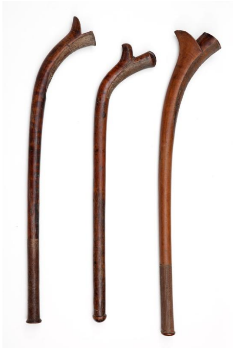
Clubs of Casuarina wood, Fiji, 19th century, Perth Museum & Art Gallery

Providing a definitive identification for the type of wood used in Pacific artefacts can be challenging. Clubs, spears and other wooden artefacts from Polynesia are often given as being manufactured from Casuarina wood (specifically Casuarina equisetifolia ). This wood is also called ironwood and known as toa throughout Polynesia. Sometimes other species of tropical hardwood were used.