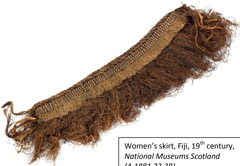
Women's skirt, Fiji, 19 th century, National Museums Scotland (A.1881.23.3B)

Hibiscus fibre is one of the main grasses used in Oceanic material. It is often shredded to make skirts. Different parts of the plant are used. For example, hibiscus bast, which comes from the outer bark of the plant, is used in banana fibre textiles from the Caroline Islands to create dark brown patterns.