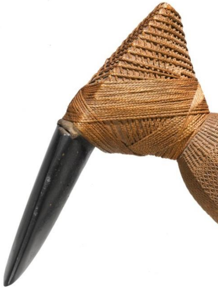
Coconut fibre binding on ceremonial adze, Cook Islands, National Museums Scotland (A.1956.1028)

Coconut fibre has a distinctive orange or copper colour. It is often found in the form of cordage used as a binding or a suspension cord and may comprise two sections twisted together or three or more sections braided.