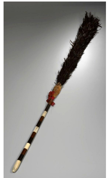
Fly whisk ( kahili ) with red trade cloth tied around handle, Hawaiian Islands, 19 th century, National Museums Scotland (A.1948.278)

Contact with Asia, Europe and elsewhere brought new materials to the Pacific islands. Both cloth and glass beads were seen as a valuable commodity for which islanders would exchange food and other goods. Red coloured cloth was particularly prized due to the association the colour had with status across the Pacific. Often cloth and beads have been added to artefacts and are indicative of the previous owner's wealth and power.