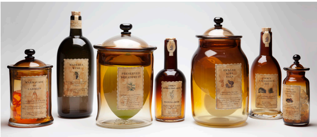
Free blown and sculpted hot glass, Cook's Collection , 2010, by James Maskrey, acquired by Perth Museum and Art Gallery.

Four grants with a total value of £3,970 were made towards the purchase of applied art by contemporary makers. They included a glass artwork by James Maskrey, Cook's Collection , acquired by Perth Museum and Art Gallery, which imagines a range of bottled and labelled foodstuffs which might have been consumed during Captain James Cook's voyages to the