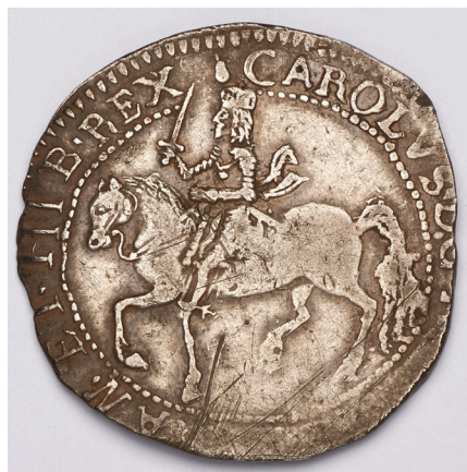
Halfcrown of Charles I, Hartlebury Mint, acquired by Inverness Museum and Art Gallery.

was chartered to sail in company with the Morning to the assistance of RRS Discovery and in 1910 sailed to the Antarctic again under the command of Captain Scott. Later she was chartered to carry coal for the Dominion Steel and Coal Company of Canada. In 1943 while on a charter to supply US bases, she foundered off the coast of Greenland having given sixty years of service in some of the world's most treacherous waters. The model is a valuable addition to collections relating to polar exploration and Dundee's important whaling industry.