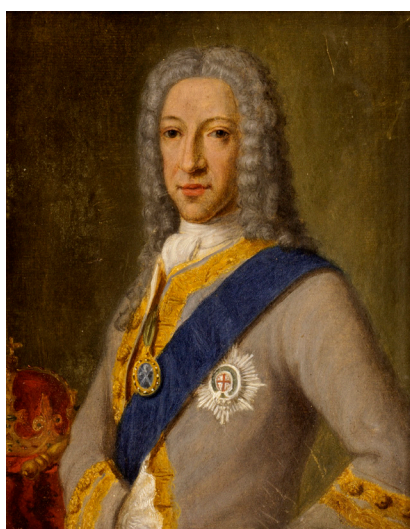
Portrait of Prince James Francis Edward Stuart by Cosmo Alexander, acquired by University of Aberdeen Museums.

Fine Art represented the largest acquisition category with 25 grants totalling £90,644 made to 19 organisations. University of Aberdeen Museums acquired a small bodycolour portrait of Prince James Francis Edward Stuart, the 'Old Pretender', by the Aberdeen painter Cosmo Alexander (1724–72). Alexander fought at the Battle of Culloden, afterwards making his escape to the Continent where he is recorded in Rome in 1747. Based on the 1748 portrait of the 'Old Pretender' by Anton Raphael Mengs (1728–79), which Alexander is known to have copied, this is a rare example of the small-format likenesses of the Stuarts which were discreetly displayed by members of the Jacobite community of northern Scotland in the years after Culloden. The combination of a Jacobite subject and an artist closely associated with Aberdeen makes this a significant and highly appropriate addition to the University's collections. The Fund supported a