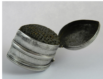
Silver nutmeg grater by Hugh Ross II or III, acquired by Tain and District Museum.