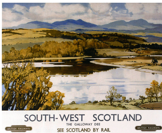
British Railways advertising poster, South-West Scotland: The Galloway Dee , 1950-53, designed by Charles Oppenheimer, acquired by Dumfries and Galloway Council Museums Service.

Dumfries and Galloway Council acquired a British Railways advertising poster, South-West Scotland: The Galloway Dee , 1950–53, by Charles Oppenheimer (1875–1961) for the collection at the Stewartry Museum in Kirkcudbright. Oppenheimer, who settled there in 1908, was one of the key figures in the artistic community which flourished in Kirkcudbright from around 1880 to 1975. He designed railway posters for British Railways and London and North Eastern Railways and the collection at the Stewartry Museum already contains two examples of these. The Galloway Dee is particularly significant as it portrays the view from the artist's studio at Woodlea on the outskirts of Kirkcudbright.