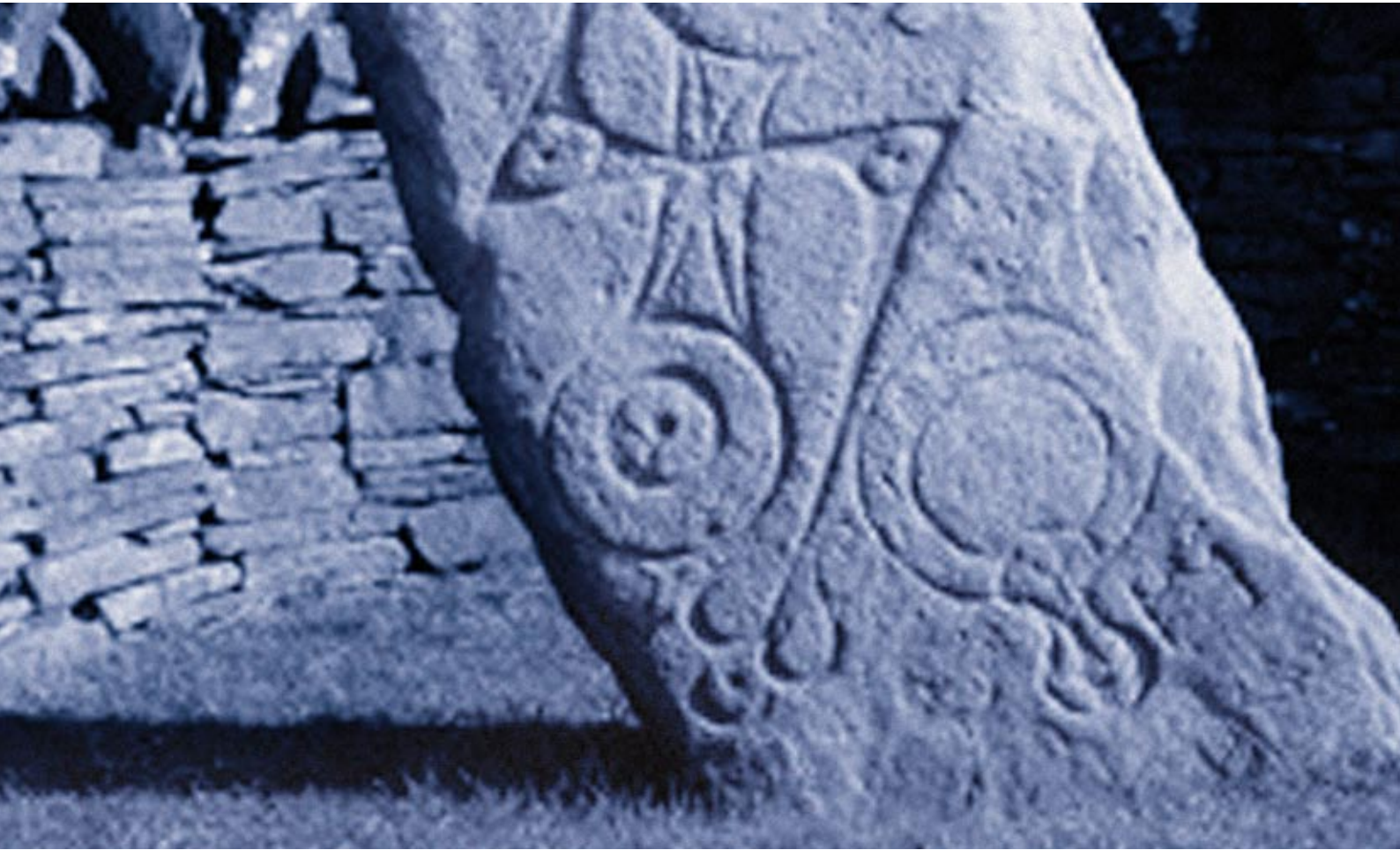
Aberlemno 1, Angus