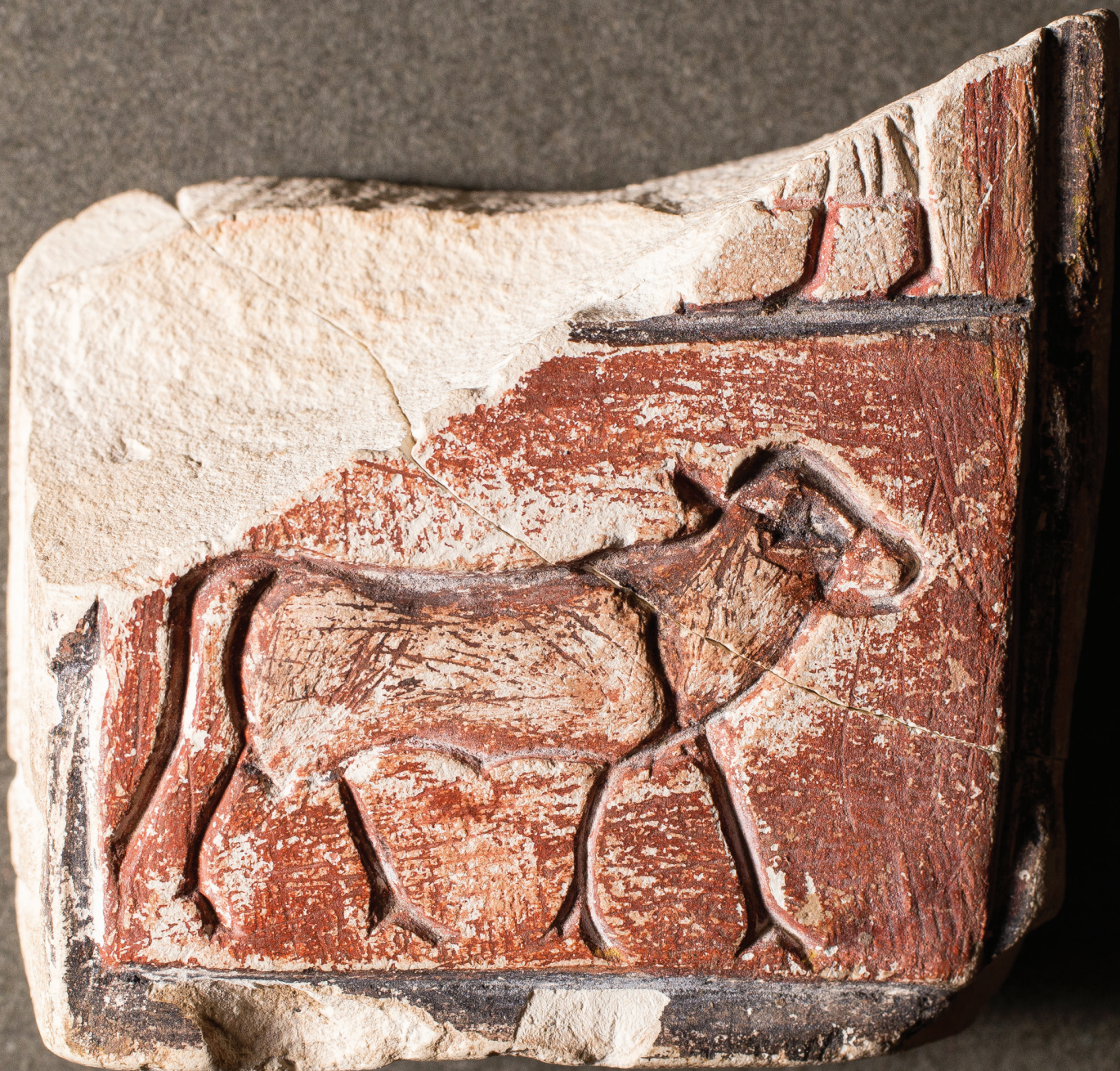
Stone stela dedicated to the cow goddess Hathor, Falconer Museum