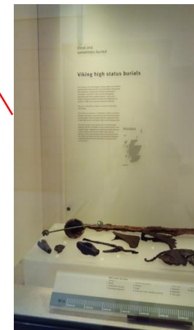
W14 - Viking High Status Burials