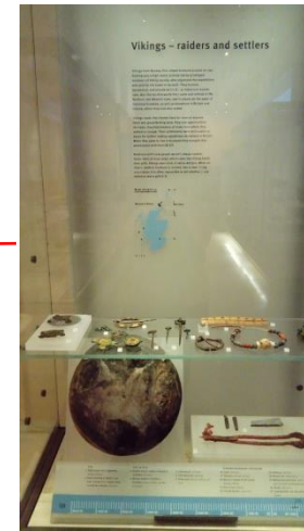
Q8 - Viking Raiders and Traders Q9 - North to south