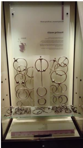
U1 - Hoarding wealth