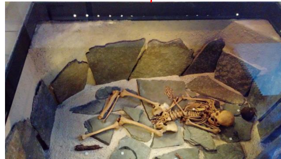
W7 - Viking Grave