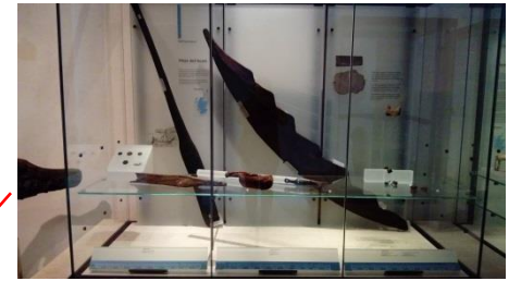
P2 - Ships and Boats