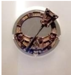
V7 - Hunterston Brooch