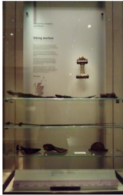
R10 - Viking Warfare