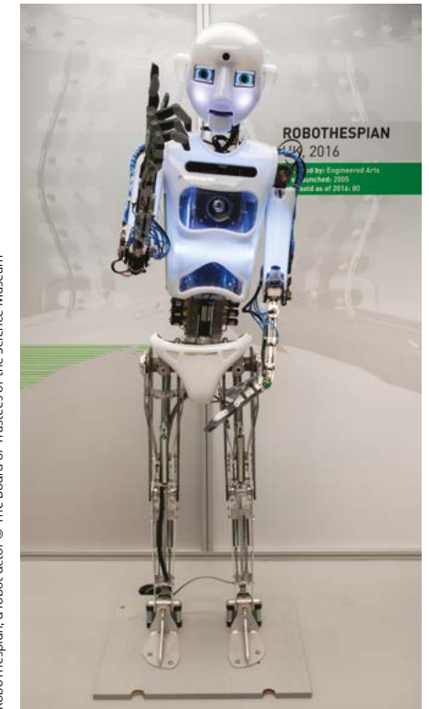
RoboThespian, a robot actor