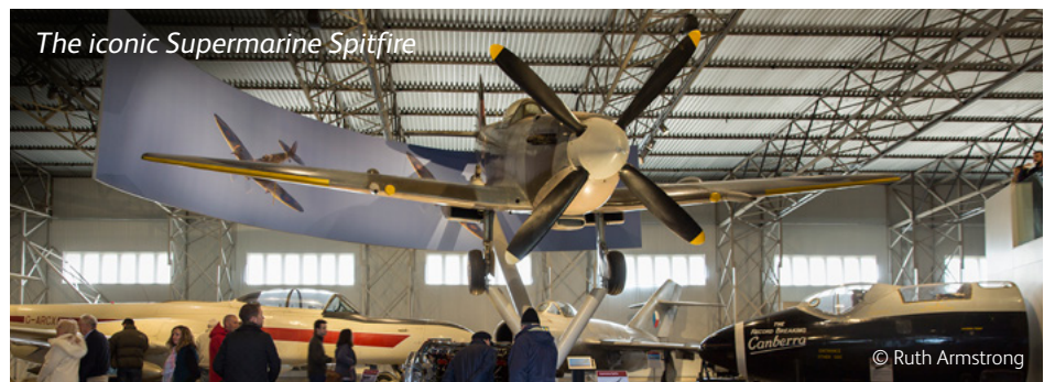
The iconic Supermarine Spitfire

For more information email tours@nms.ac.uk or call +44 (0) 131 247 4238