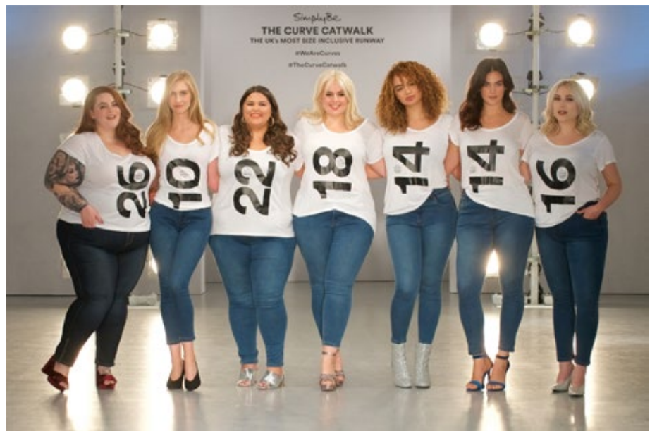
© Simply Be Curve Catwalk AW17

+44 (0)131 247 4284 touringexhibitions@nms.ac.uk nms.ac.uk/bodybeautiful