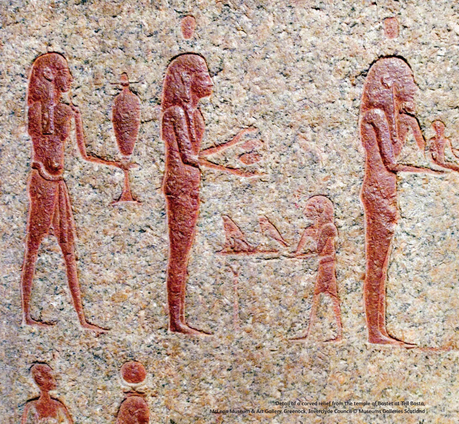
Detail of a carved relief from the temple of Bastet at Tell Basta, McLean Museum & Art Gallery, Greenock, Inverclyde Council