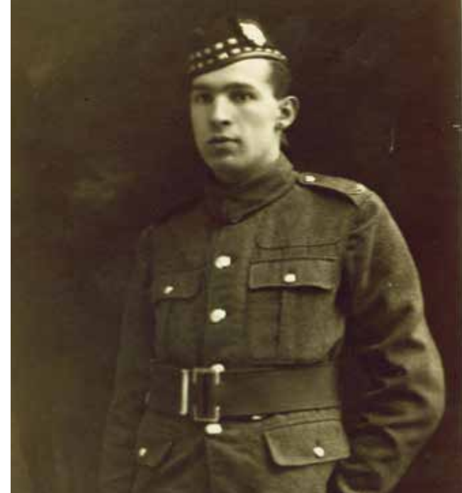
A Royal Scots Soldier around 1915.

Learners could look at the Quintinshill Rail crash, near Gretna in Dumfriesshire, which claimed the lives of 210 Royal Scots travelling from Larbert to Liverpool during the First World War. They could also investigate some of the Victoria Cross recipients and find out why they were awarded the medal.