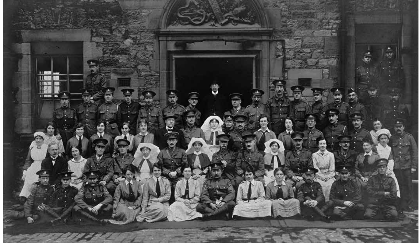
Medical staff and soldiers at the Military Hospital https://www.scran.ac.uk.

The courtyard area outside the National War Museum is called Hospital Square. The building was originally built in the 1700s as a storehouse, then from 1897 it was used as a military hospital for the Castle. During the First World War, it was used as a hospital for both allies and prisoners of war.