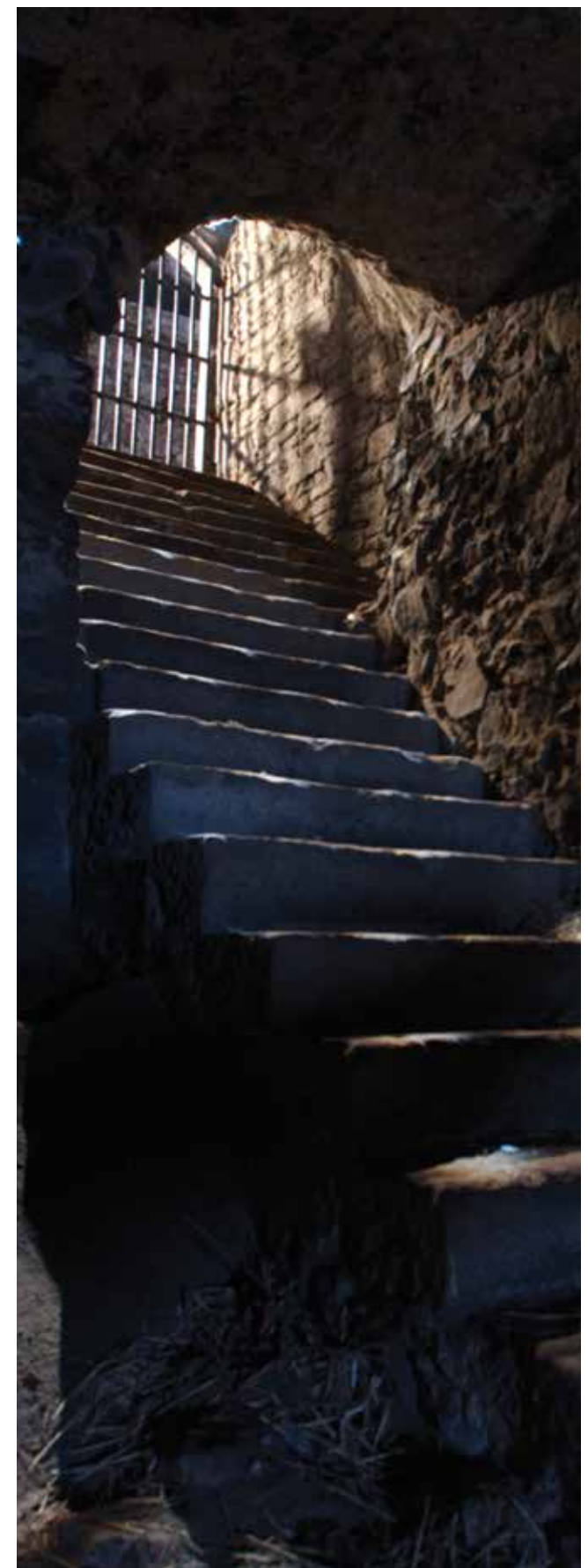
Stairs leading to the prisons.