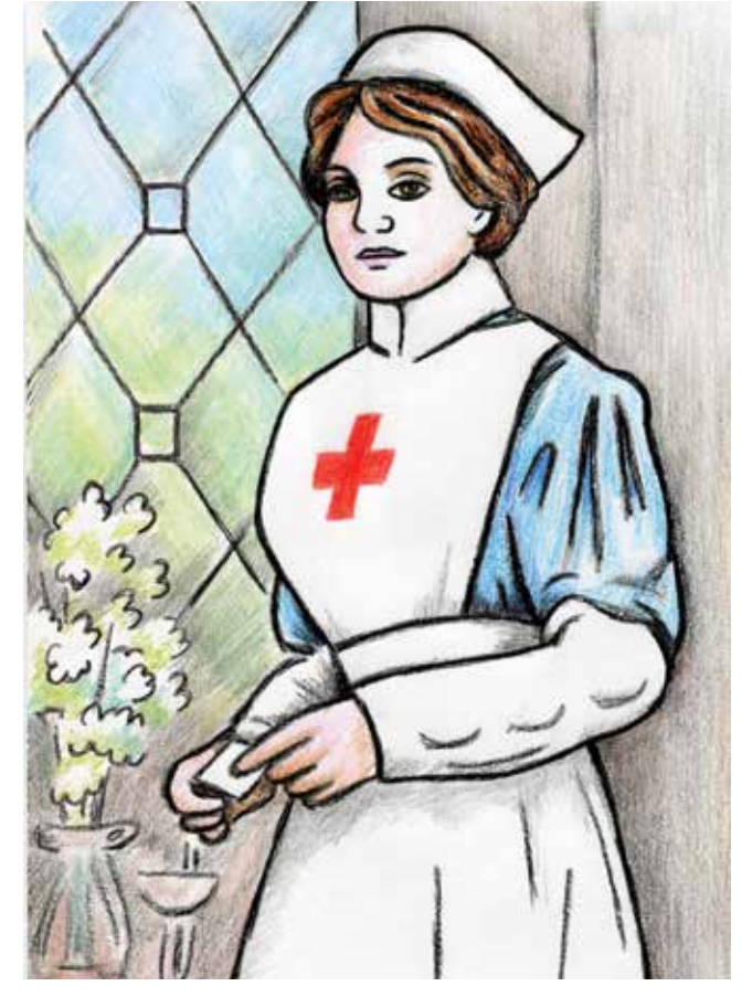
Voluntary Aid Detachment nurse illustration.

A nurse wearing a uniform like this will look after you. Take a picture of the uniform or draw it in the box opposite.