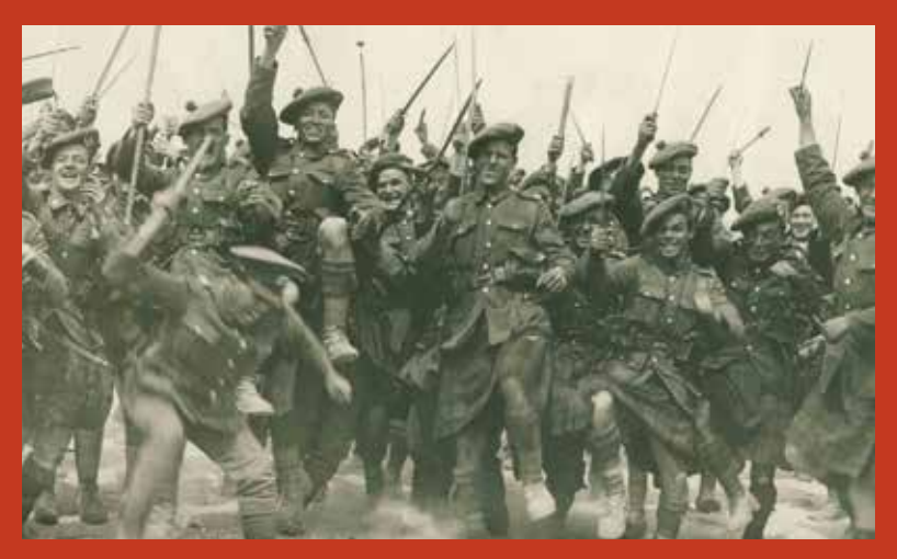
4th South African Infantry (South African Scottish)

More than 33,000 people explored the stories of the Scottish diaspora and the Commonwealth nations during the First World War at the National Museum of Scotland during summer 2014. Common Cause: Commonwealth Scots and the Great War included poignant objects borrowed from partners in Canada, South Africa, Australia and New Zealand. The exhibition was supported by the Scottish Government as part of the Year of Homecoming 2014.