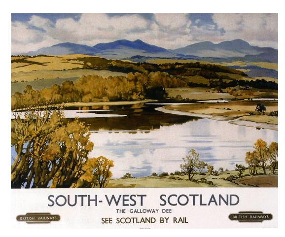
British Railways advertising poster, South-West Scotland: The Galloway Dee , 1950-53, designed by Charles Oppenheimer, acquired by Dumfries and Galloway Council Museums Service.

Dumfries and Galloway Council acquired a British Railways advertising poster, South-West Scotland: The Galloway Dee, 1950-53, by Charles Oppenheimer (1875–1961) for the collection at the Stewartry Museum in Kirkcudbright. Oppenheimer, who settled there in 1908, was one of the key figures in the artistic community which flourished in Kirkcudbright from around 1880 to 1975. He designed railway posters for British Railways and London and North Eastern Railways and the collection at the Stewartry Museum already contains two examples of these. The Galloway Dee is particularly significant as it portrays the view from the artist's studio at Woodlea on the outskirts of Kirkcudbright.