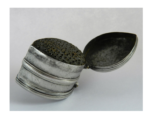
Silver nutmeg grater by Hugh Ross II or III, acquired by Tain and District Museum.

silversmiths worked in Tain under the name Hugh Ross and three nutmeg graters were among the items sold off after the death of Hugh Ross III in 1786. The silver collection at Tain, the largest and most representative collection of Tain silver in existence, has recently benefited from a Heritage Lottery Fund Collecting Cultures grant which has enabled the museum to transform the display and interpretation of the collection.