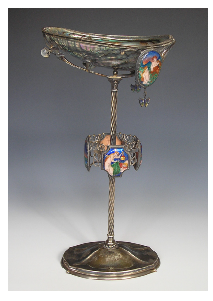
Silver chalice with paua shell cup, 1906, designed by Ramsay Traquair, made by J M Talbot, with six enamel plaques by Phoebe Anna Traquair, acquired by Glasgow Museums.

Tain and District Museum acquired three rare examples of Tain silver at auction, a silver nutmeg grater made by Hugh Ross II or III, probably between 1760 and 1780, and Madeira and Hollands wine labels by William Innes (1800–67) dating from c1830–4. The nutmeg grater is a particularly rare item and the only extant example of this type of object known by the maker. Three