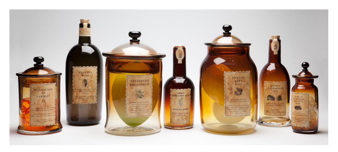
Free blown and sculpted hot glass, Cook's Collection , 2010, by James Maskrey, acquired by Perth Museum and Art Gallery.

Four grants with a total value of £3,970 were made towards the purchase of applied art by contemporary makers. They included a glass artwork by James Maskrey, Cook's Collection , acquired by Perth Museum and Art Gallery, which imagines a range of bottled and labelled foodstuffs which might have been consumed during Captain James Cook's voyages to the