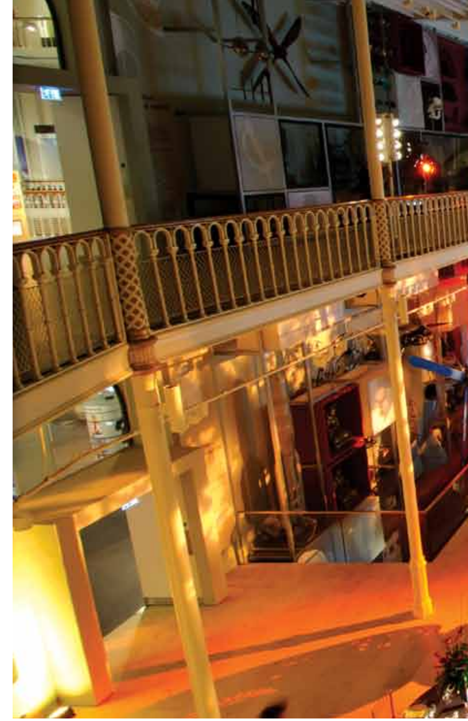
Grand Gallery, National Museum of Scotland

large areas next to the auditorium where you can register attendees, hold an exhibition or break for coffee or lunch.