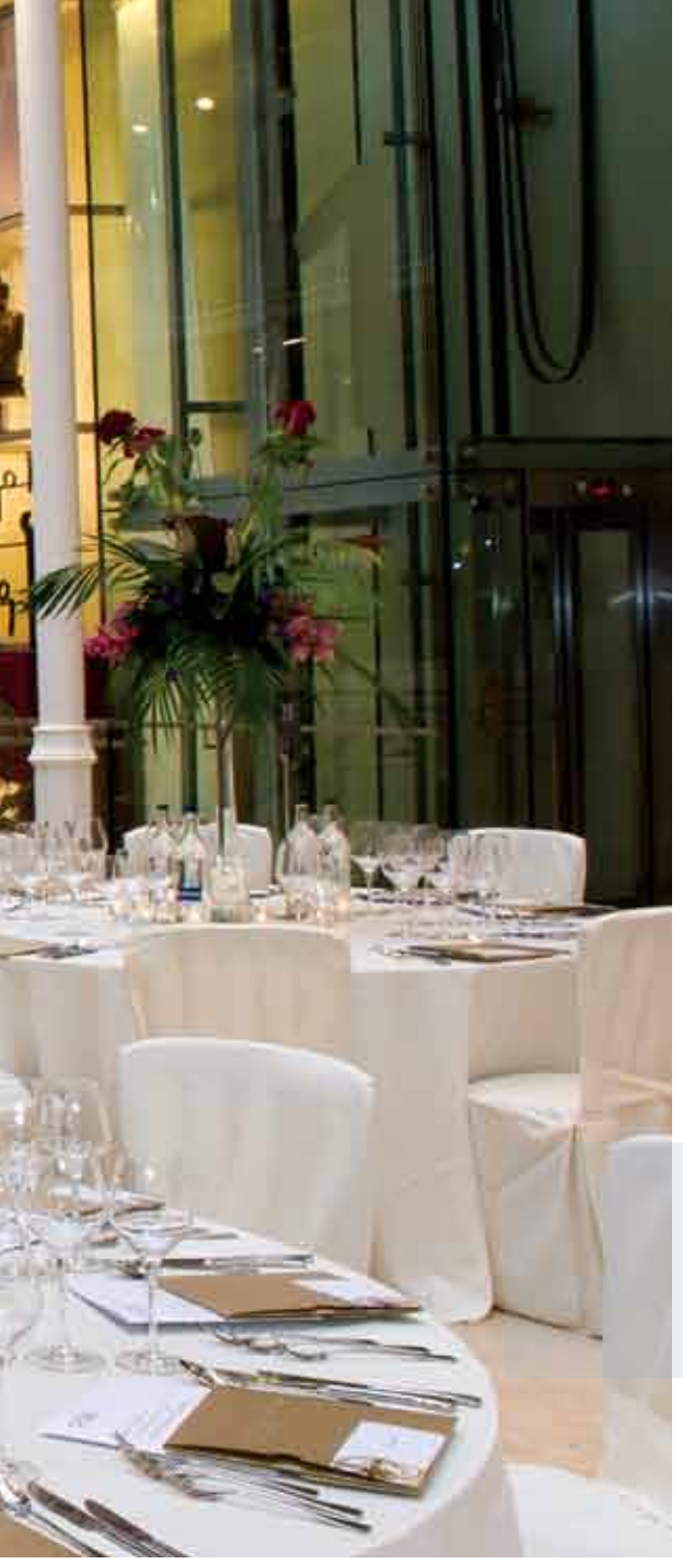
Grand Gallery, National Museum of Scotland

National Museum of Rural Life Museum and farm close to Glasaow