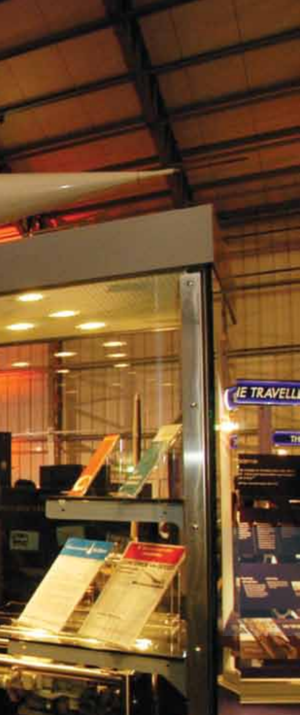
Concorde Experience, National Museum of Flight